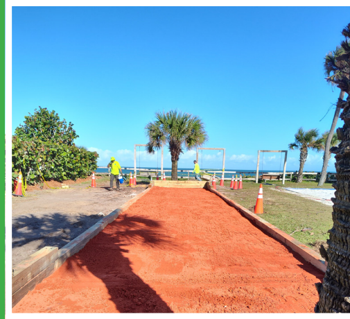
Adding the top clay layer

The Town of Indialantic & the Town of Melbourne Beach