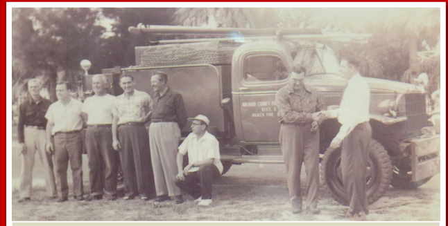
Presentation of the 1 st MBVFD fire truck - 1953

CELEBRATING 70 YEARS OF SERVICE – On June 17 th 1953, six town residents held a meeting and formed what is now known as the Melbourne Beach Volunteer Fire Department. For the past 70 years, through a high level of volunteer commitment, training, and the addition of state-of-the-art equipment, the Department has continually evolved to improve its emergency response capabilities and support the changing needs of our residents and community; all while saving the Melbourne Beach tax payers millions of dollars in salary and equipment costs compared to other local municipalities.