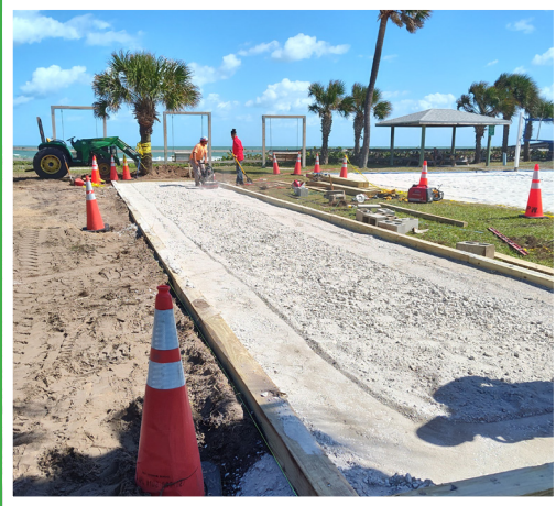
Tamping down the gravel layer

The new bocce court at Ocean Park is now open for use! Shade awnings will be built on each end at a later date. Two benches from Ryckman Park will also be moved to Ocean Park to provide additional spectator seating.